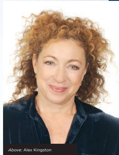
Above: Alex Kingston

brief got me started on a long train of thought about River and where she came from.