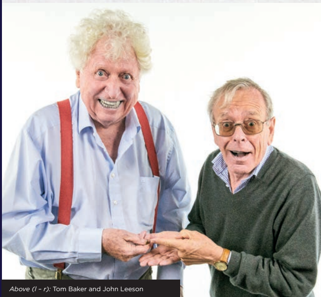
Above (l – r): Tom Baker and John Leeson