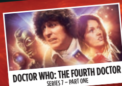
DOCTOR WHO: THE FOURTH DOCTOR SERIES 7 - PART ONE