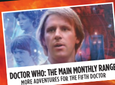
DOCTOR WHO: THE MAIN MONTHLY RANGE MORE ADVENTURES FOR THE FIFTH DOCTOR