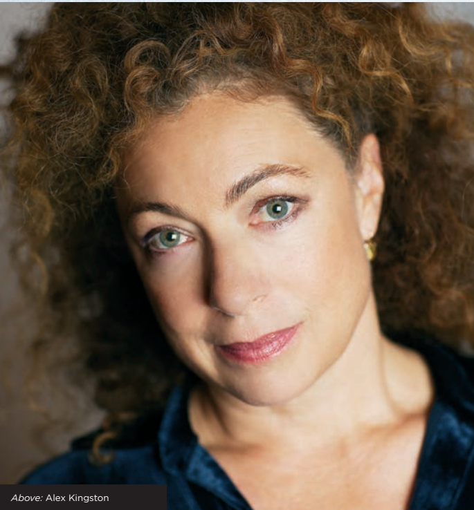
Above: Alex Kingston