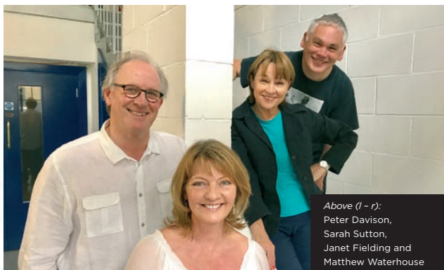
Above (l-r): Peter Davison, Sarah Sutton, Janet Fielding and Matthew Waterhouse

way through the members of the Mazzini family – and the Doctor and his friends have to stay alive long enough to discover the killer's identity.