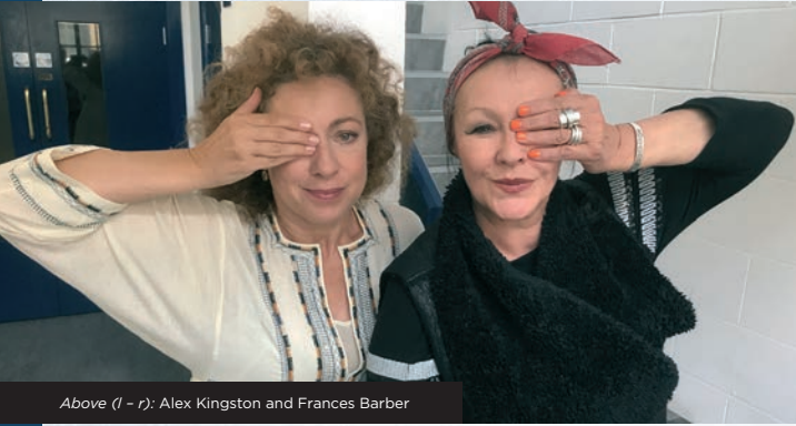
Above (l - r): Alex Kingston and Frances Barber

time she met an earlier incarnation was happening a lot, so I thought it'd be fun if I made that amnesia a big part of the story. It meant there would be use of the lipstick.