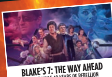
BLAKE'S 7: THE WAY AHEAD CELEBRATING 40 YEARS OF REBELLION