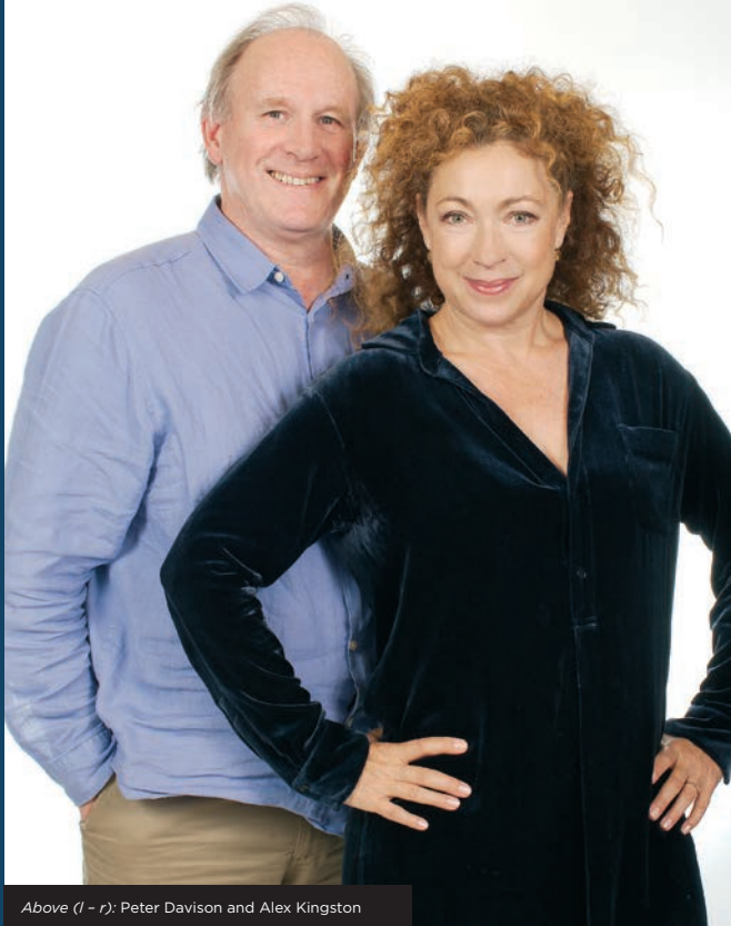
Above (l - r): Peter Davison and Alex Kingston