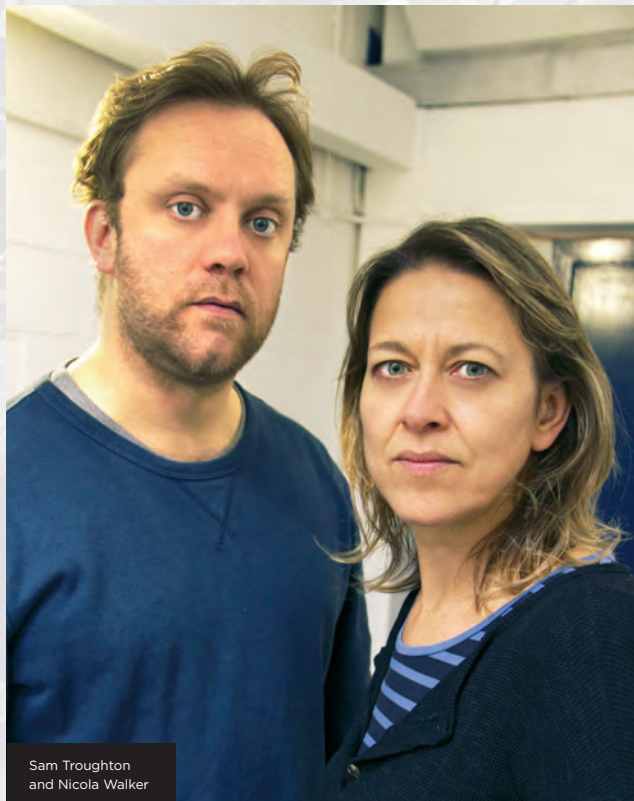
Sam Troughton and Nicola Walker