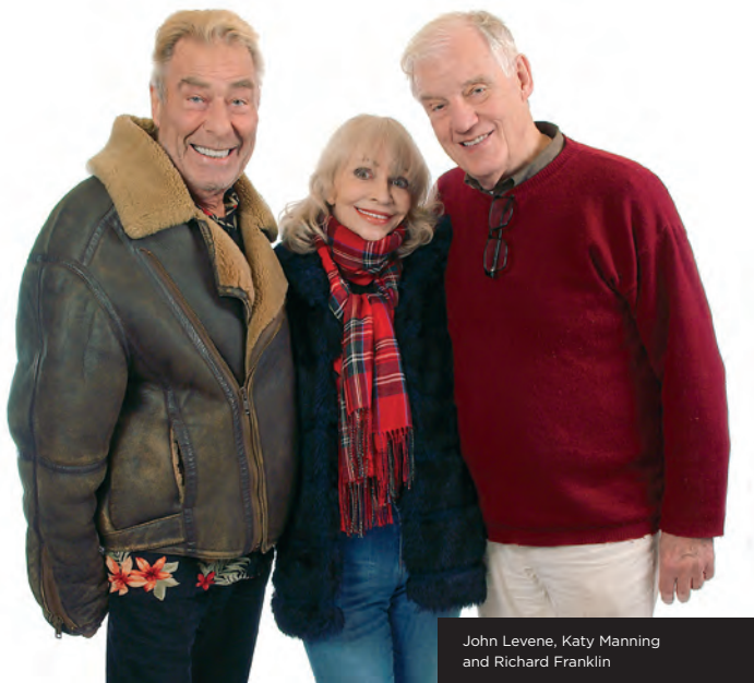
John Levene, Katy Manning and Richard Franklin

“ I DON'T NEED TO SIT IN MAKE UP FOR FOUR HOURS, OR GET STRAPPED INTO A CORSET. ”